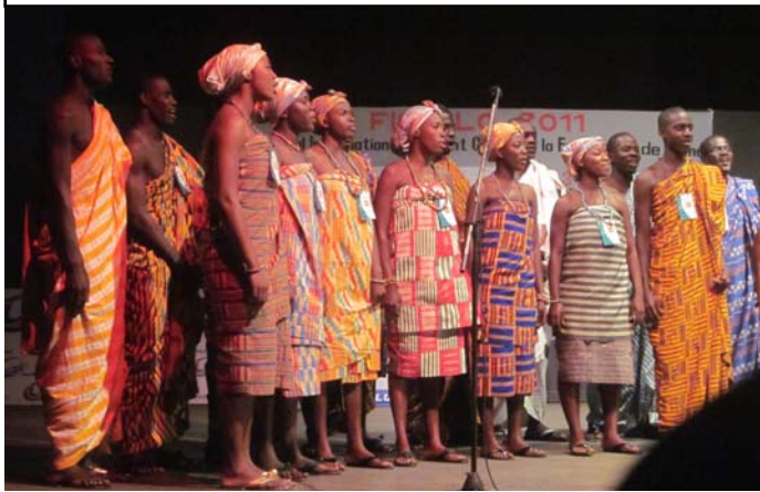
Angelics Voices from Winneba, Ghana, won 1st Prize in the Classical Music Division. Below: ChoeurQuibat from France, in concert.