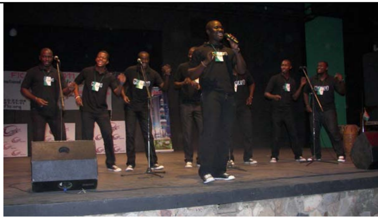
VocoPro from Senegal wowed audiences with their stylistic blend of America's Take 6 and South Africa's Ladysmith Black Mambazo. Below: Divine Providence from Cote d'Ivoire who clinched 1st Prize in the Traditional African Music Division.