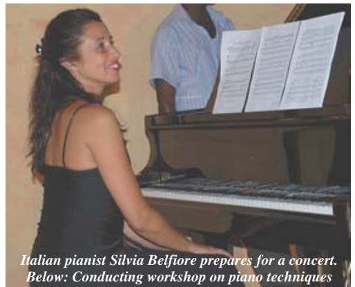
Italian pianist Silvia Belfiore prepares for a concert. Below: Conducting workshop on piano techniques